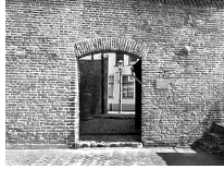
Figure 3 This a gate.

\placefigure [left] [fig:the gate] {This a gate.} {\externalfigure[gate] [height=2cm]}